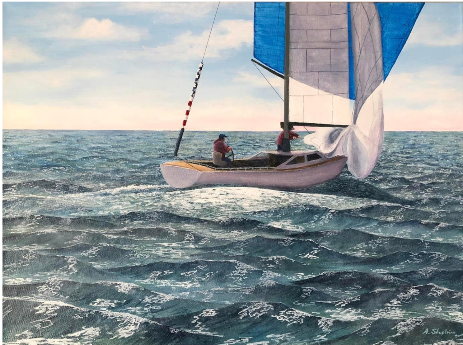
Alan Shuptrine Lookout Mountain Artist Enhanced Giclee Canvas 16 X 20 On A Run $500