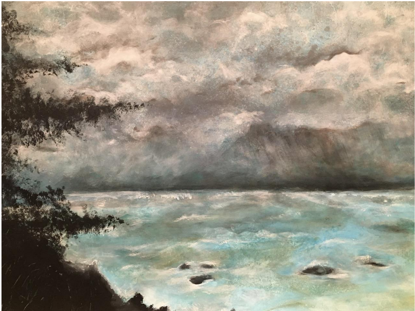
Lupina Haney Ooltewah Acrylic on Canvas 36 x 48 Stormy Seas $500