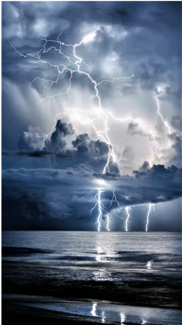
Billy Hargiss Soddy Daisy Brushed metal 20 x 16 Lighting on the Beach $232