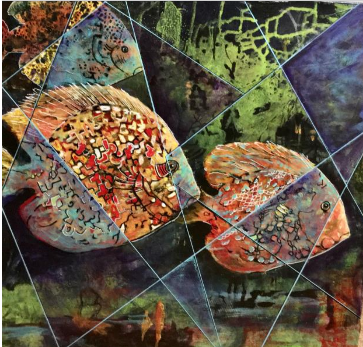
Janice Kennedy Ringgold, GA Acrylic 20 x 20 One Fish, Two Fish.... $225