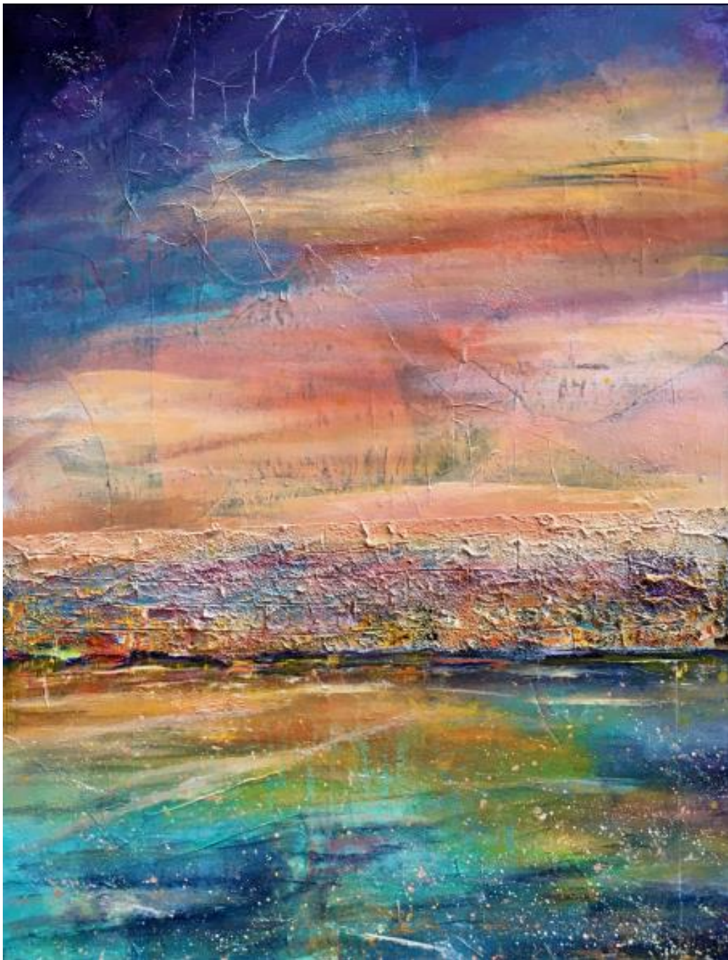
Janice Kennedy Ringgold, GA Acrylic 24 x 18 A Coral Kind of Day $225