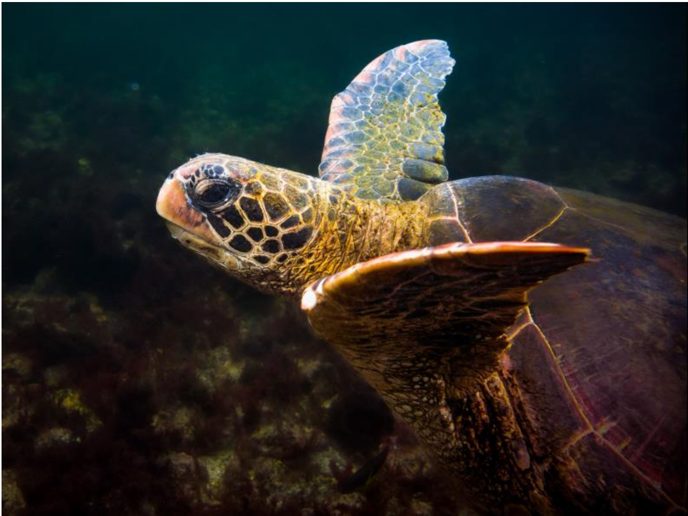
Milton McLain Harrison Photograph on Canvas 16 x 20 Sea Turtle $145