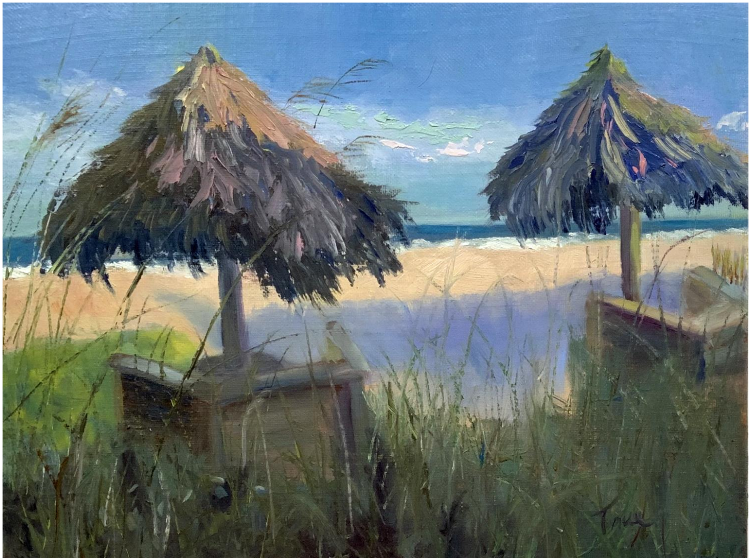
Leah True Salerno North Shore Oil on Linen Panel 11 x 14 Blue Parrot Tiki Huts $300