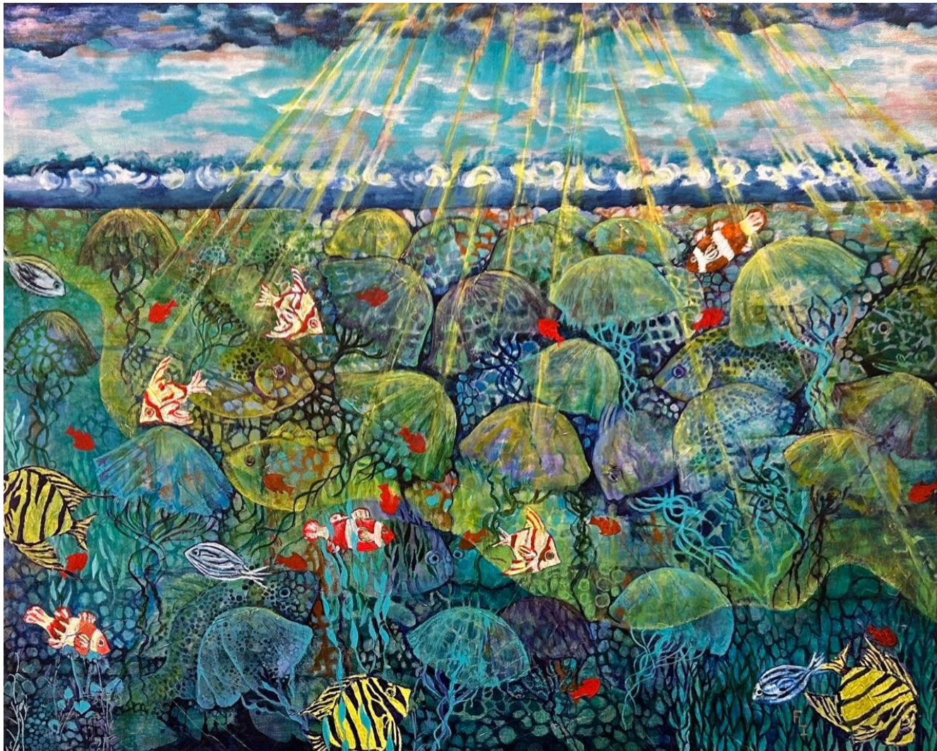
Faye Ives Chattanooga Acrylic/Mixed Media 24 x 30 What Lies Beneath $425