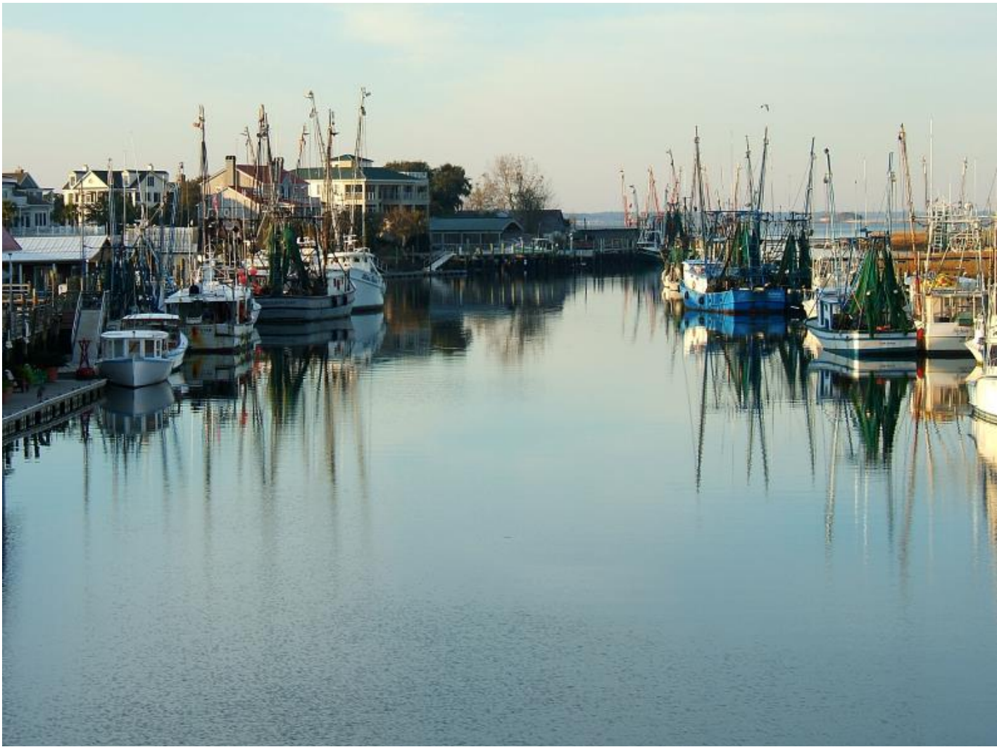
Wes Talley Cleveland Framed Photograph 20 x 30 Quite Sunrise $350