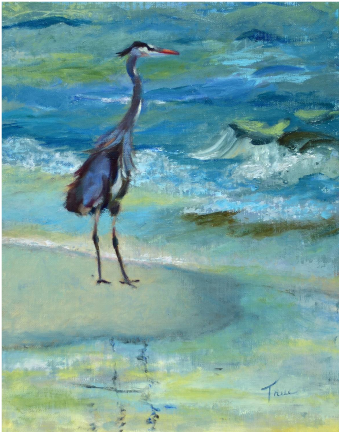
Leah True Salerno Chattanooga Oil on Linen Panel 14 x 11 Beach Heron $300