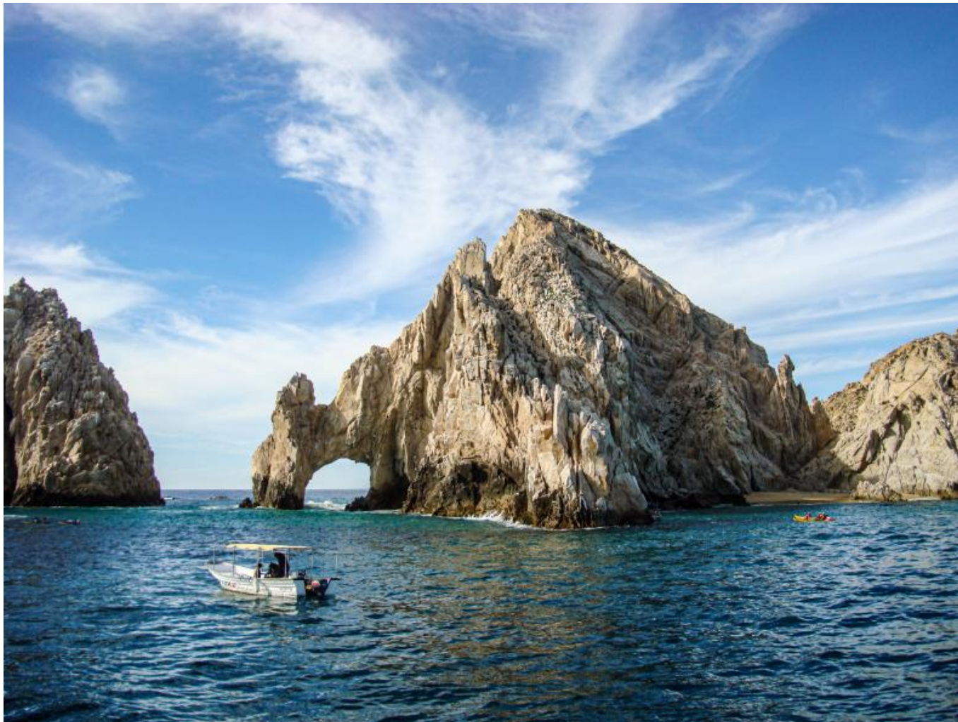
Mary McLain Harrison Photograph 15 x 20 Safe Harbor $150