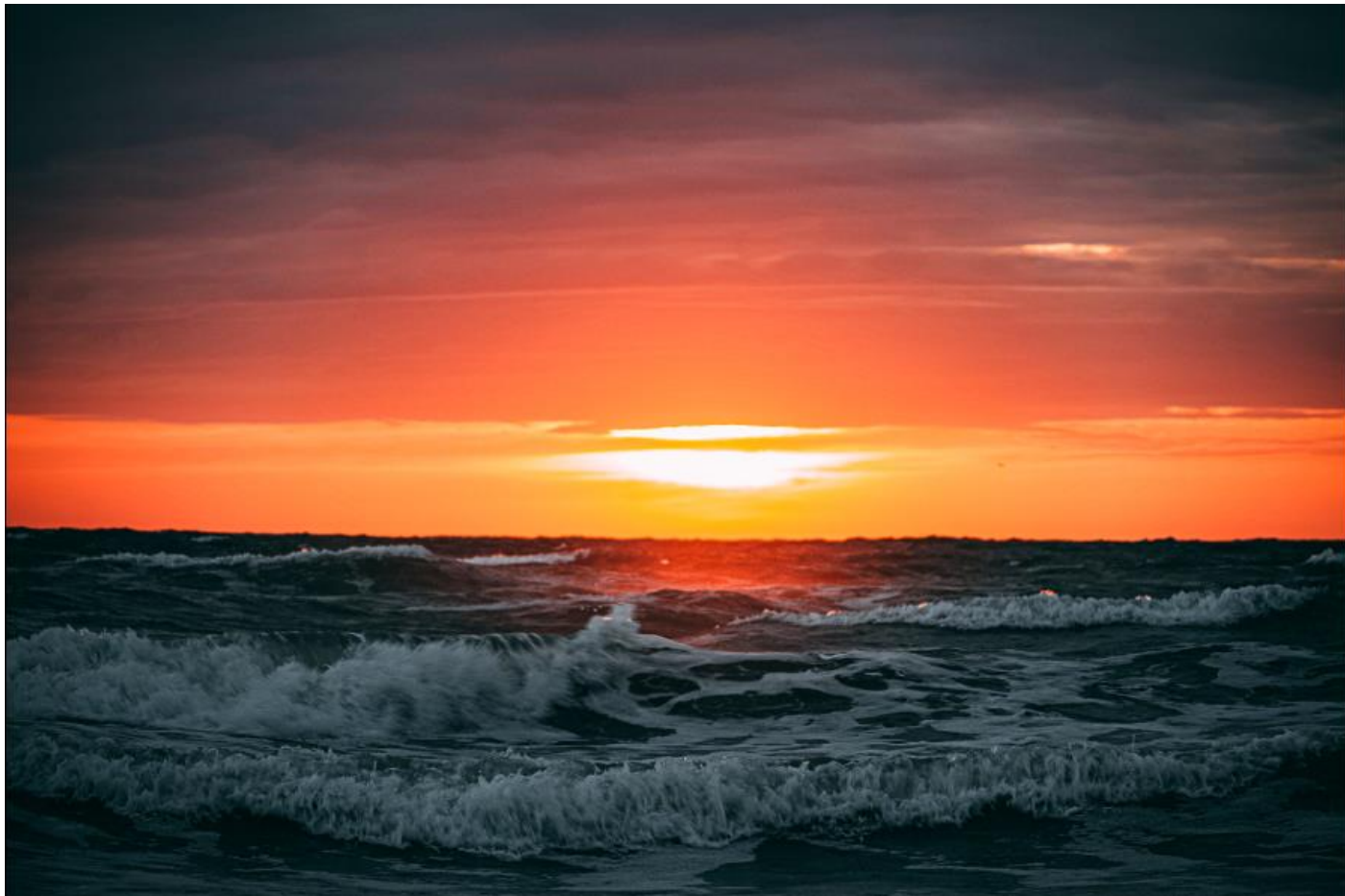
Sarah Walker Dunlap Photograph on Metal 12 x 18 Ocean's Glow $200