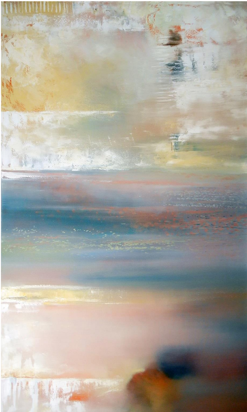
Mary Tomás Soddy Daisy Oil On Gallery Wrapped Canvas 60 X 36 The Center Between The Two $4,800