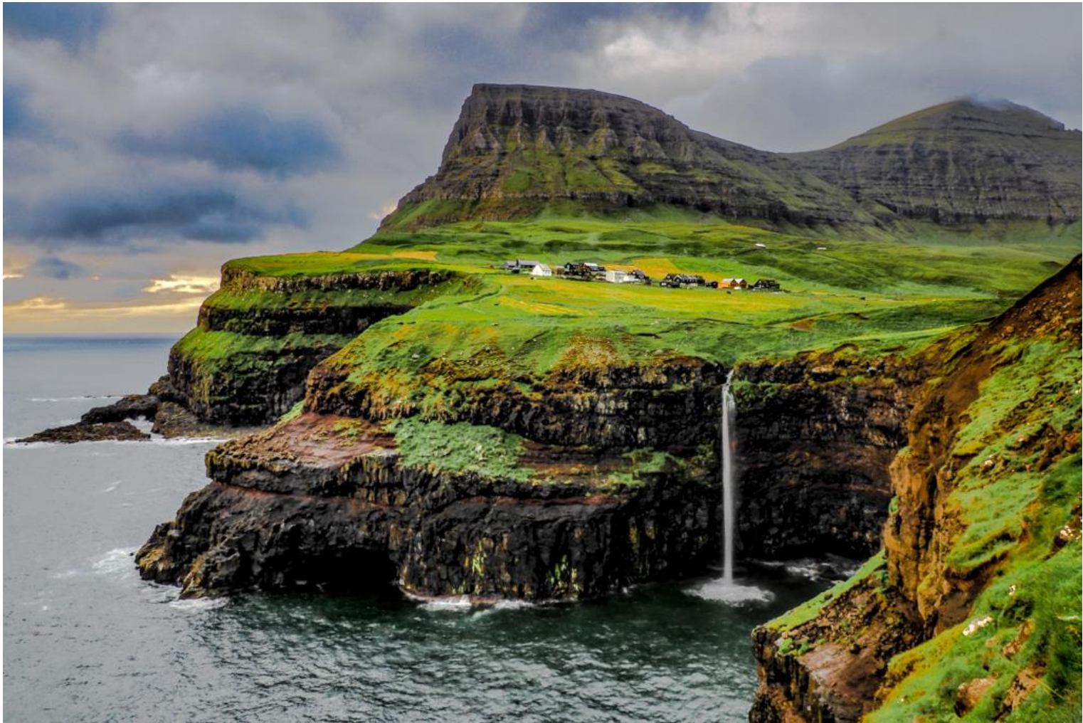
Thomas Cory Signal Mountain Color Photograph 20 x 30 Faroe Islands Icon $325