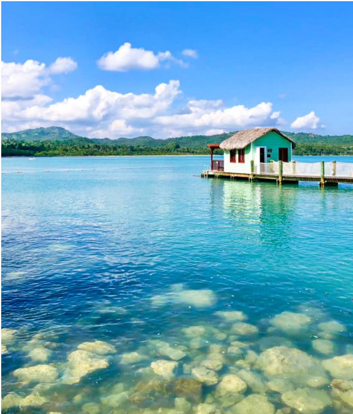
Sandy Hullander Rock Spring Photography on Canvas 20 x 20 Grand Turk Hut $150