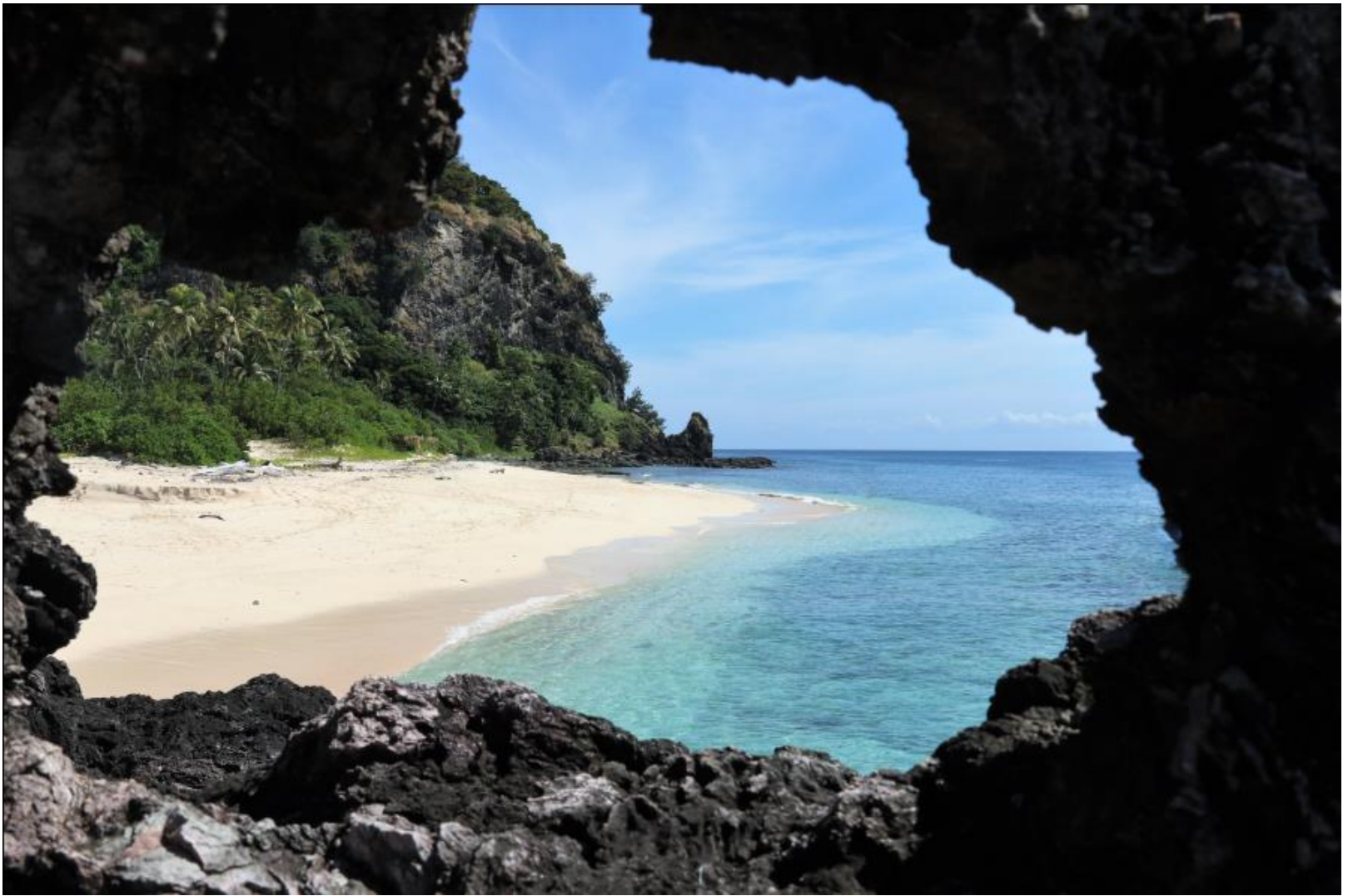
Dawn Carson Cleveland Photography on Canvas 30 x 40 Coral Garden Bora Bora $425