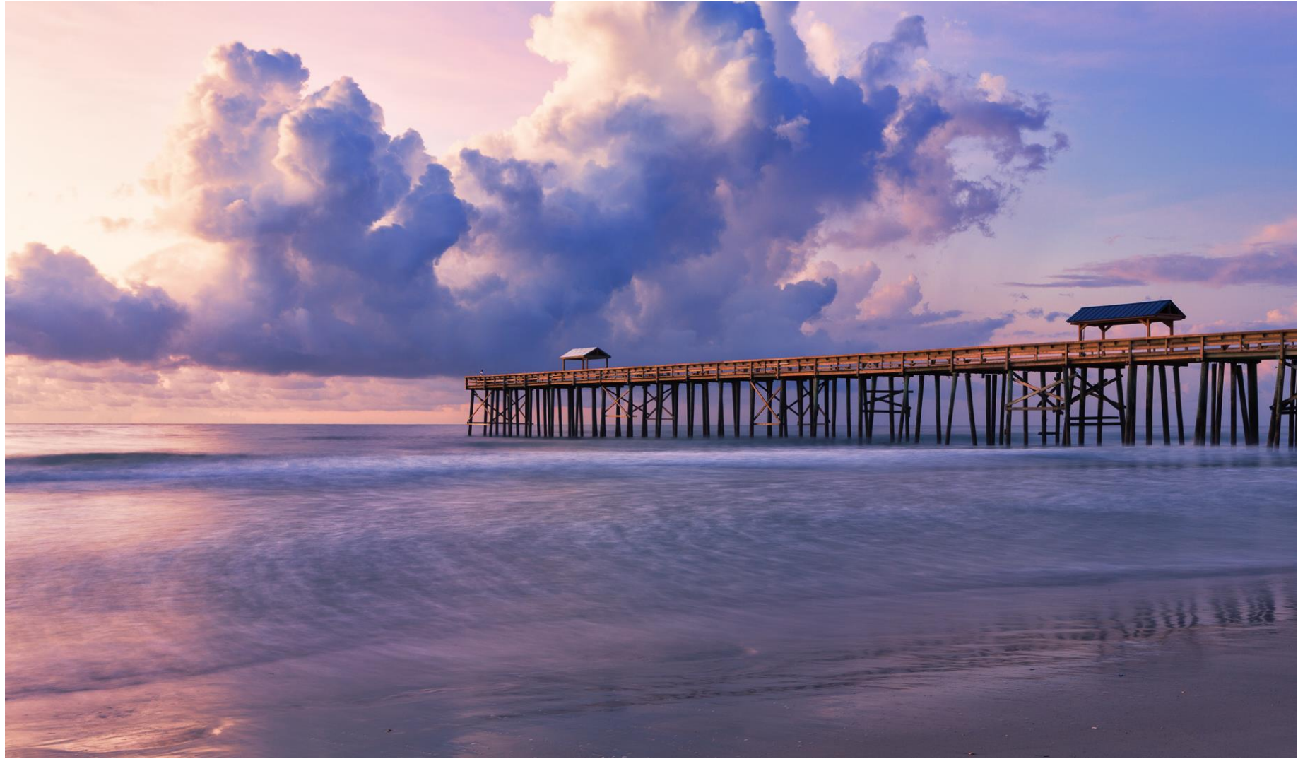
Robert Swinney Ringgold Photograph on Metal 12 x 24 Amelia Island Pier $100