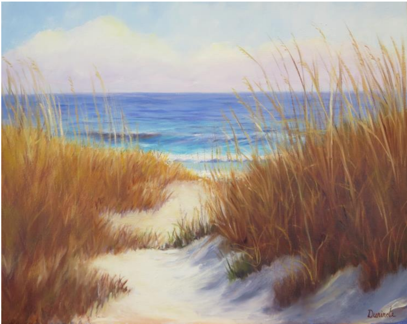
Durinda Cheek Ringgold Oil on Canvas 16 x 20 Seagrass Path $600