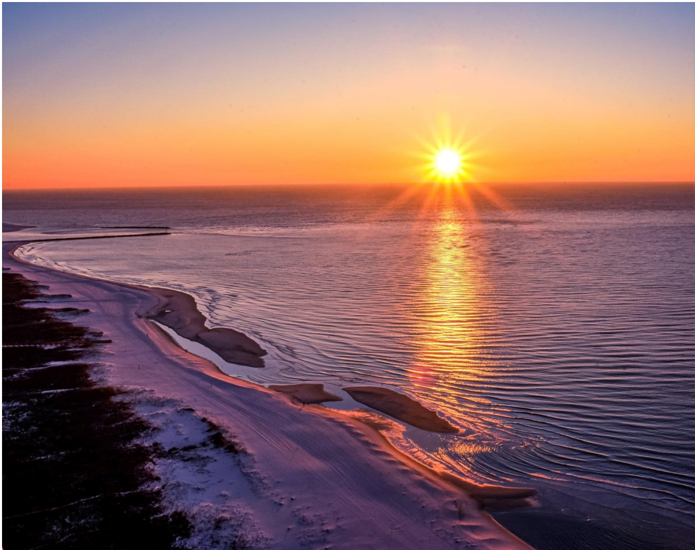
Sandy Hullander Rock Spring Photography on Canvas 20 x 30 Destin Beach Sunrise $175