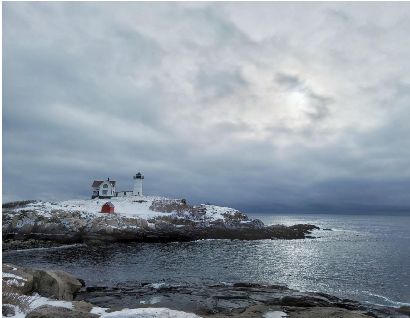
Malcolm Seheult Ooltewah Photo on Metal 11 X 14 The Lighthouse $100