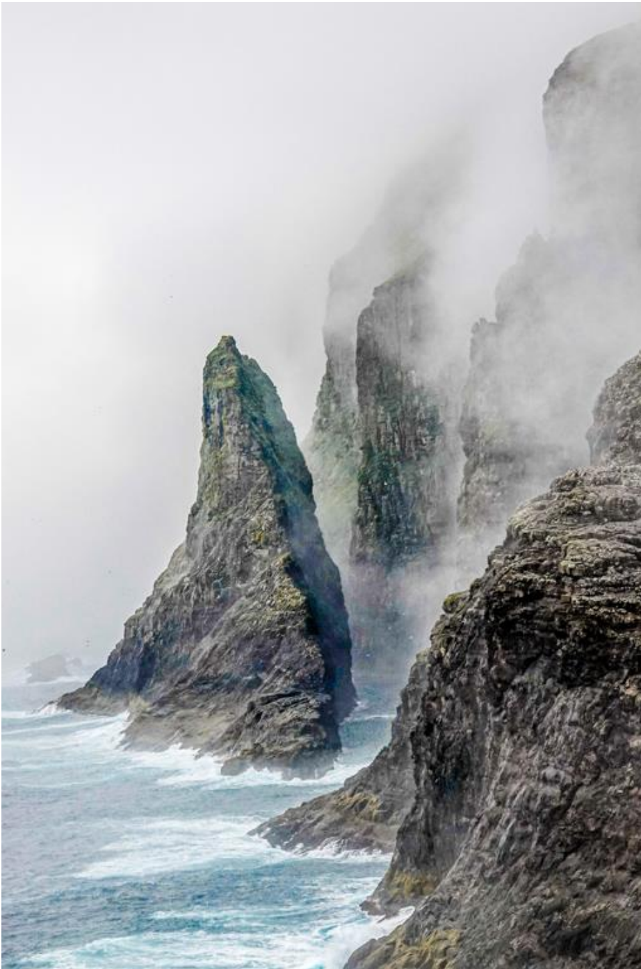
Thomas Cory Signal Mountain Color Photograph 24 x 16 In the mist $295