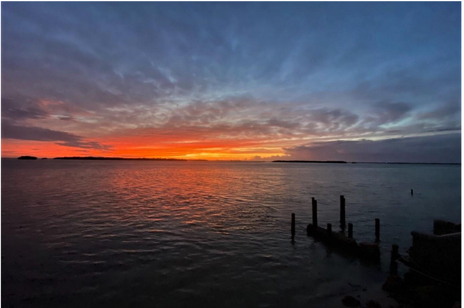
Billy Hargiss Soddy Daisy Brushed Metal 16 x 20 Sunset on The River $232