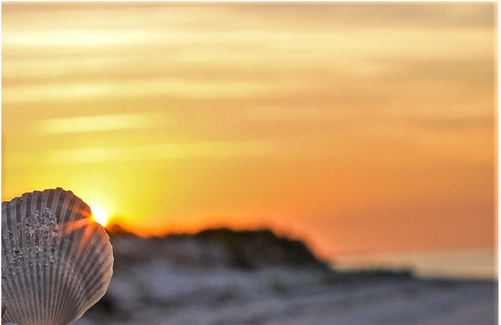
Sandy Hullander Rock Spring Photography on Canvas 16 x 24 Seashell, Jacksonville Beach $150