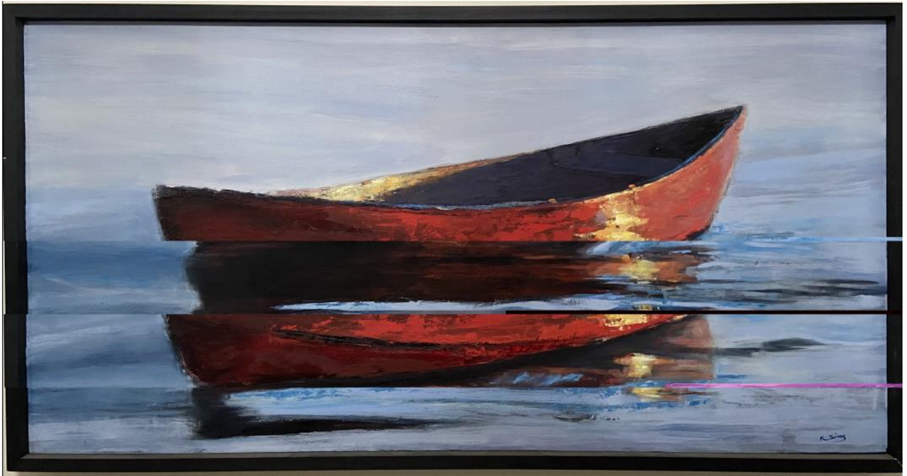
Karen Sims Davis Lookout Mountain TN Oil 25.75 X 49.75 Big Red $4,500.00