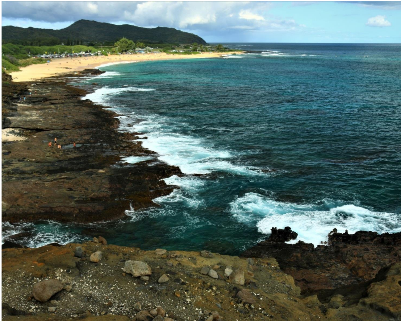
Alan Wolfe Ooltewah Framed Photograph 14 x 18 Sandy Beach Park Hawaii $75