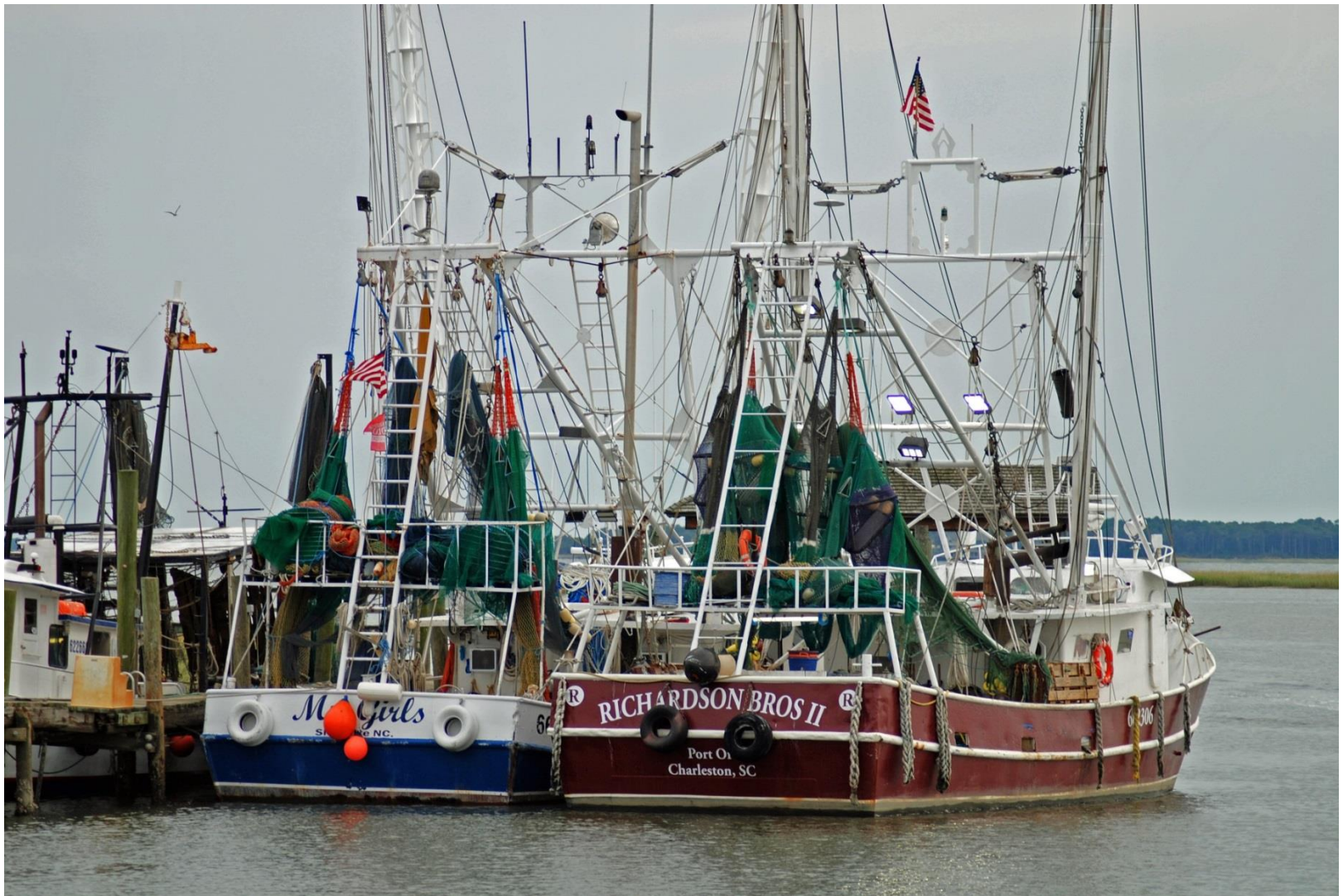
Wes Talley Cleveland Framed Photograph 20 x 30 Fishing in the Creek $350