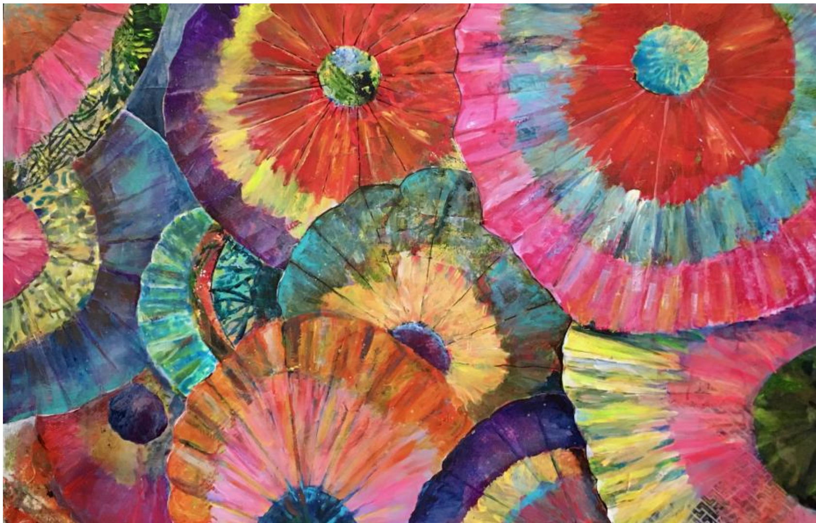
Janice Kennedy Ringgold, GA Acrylic 24 x 36 Sun Shades $350