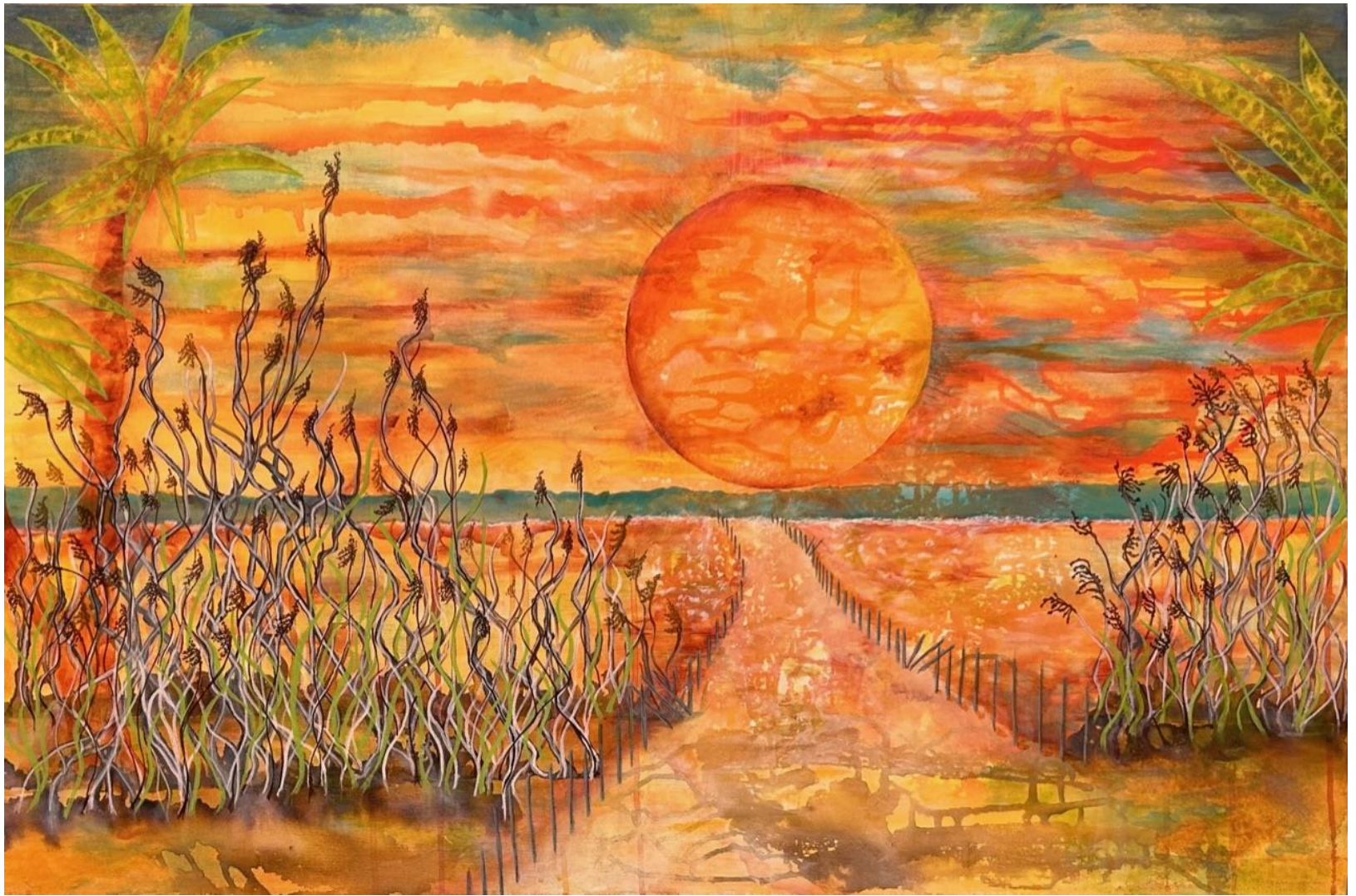
Faye Ives Chattanooga Acrylic Pens and Ink 24 x 36 Golden Hour $495