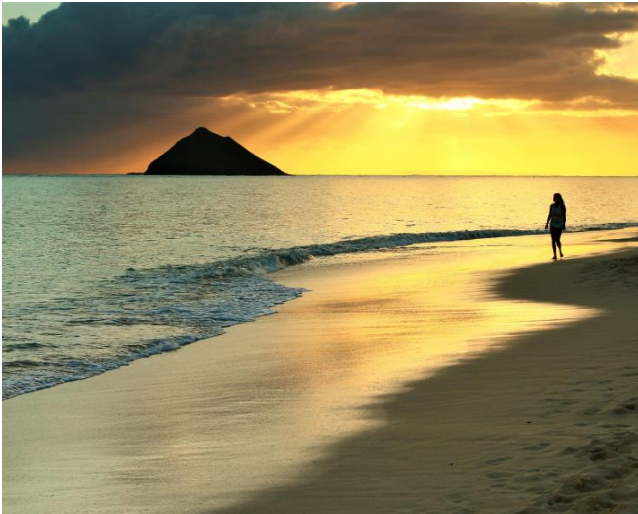
Alan Wolfe Ooltewah Framed Photograph 14 x 18 Early Morning Stroll $75