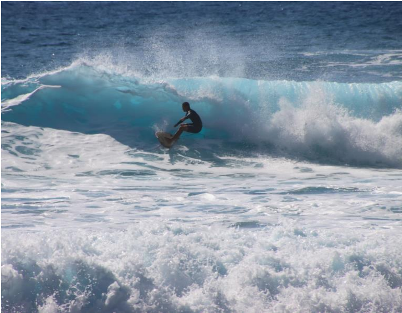
Joni Giddings Hixson Framed Photograph 24 x 36 Tubal wave $280