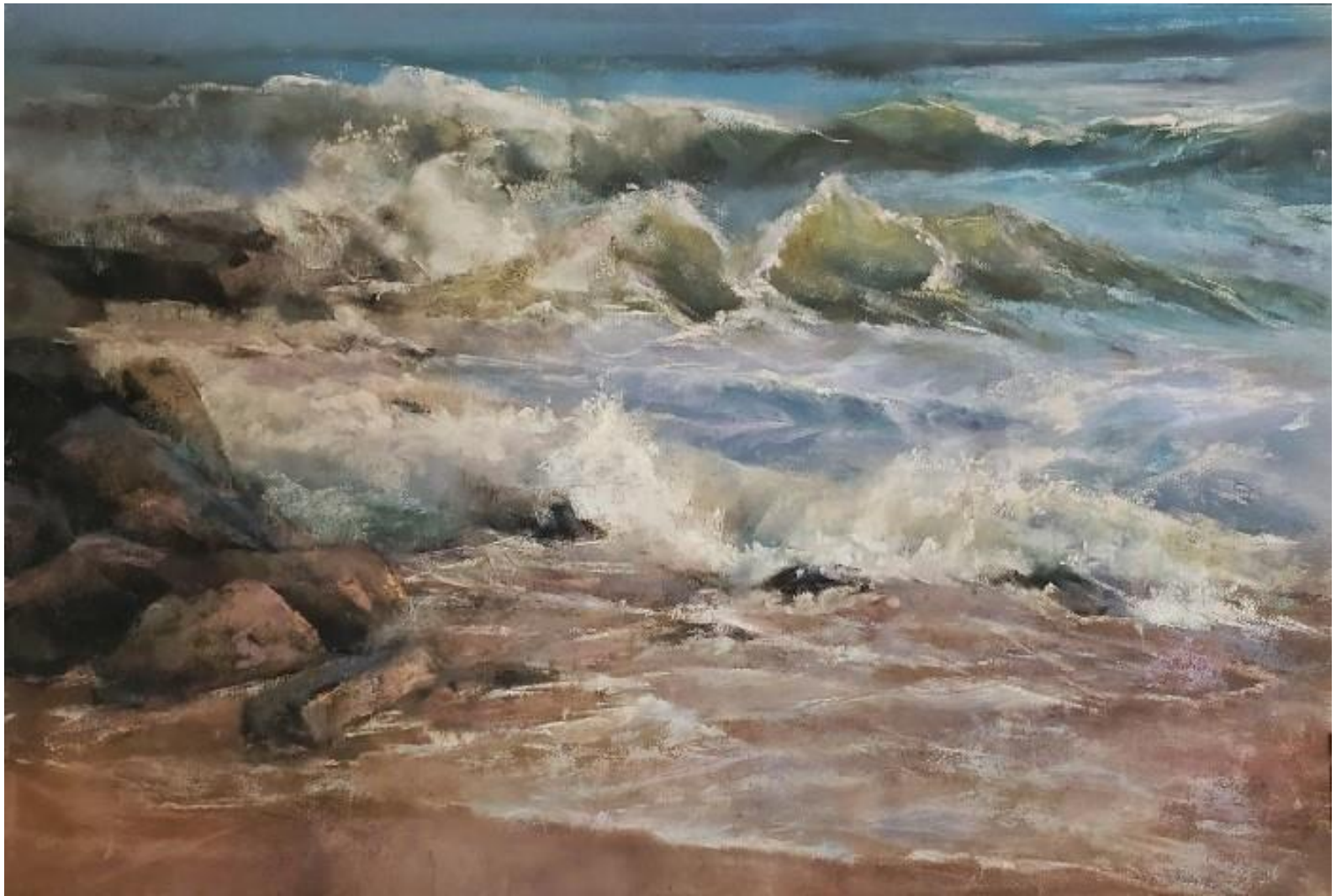
Linda Coulter Hixson Pastels 16 x 20 After the Storm $600